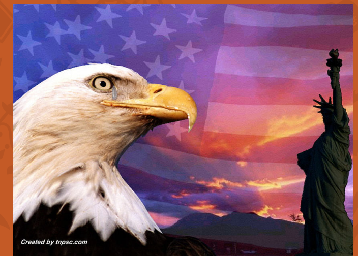
Created by Inps.com