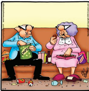
"Hurry! Our New Year's resolutions start in ten minutes."